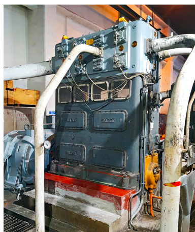
50-year-old nitrogen Laby® Compressor after foundation repair