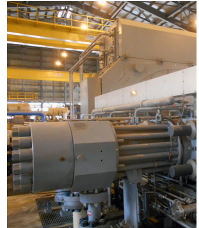
Hyper Compressor K8