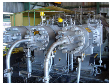
Compressor after revamp

"Burckhardt Compression proved to be a world class partner for service and maintenance. As turn-key contractor, they managed to deliver on-time with the expected quality and improved the overall performance to our full satisfaction"